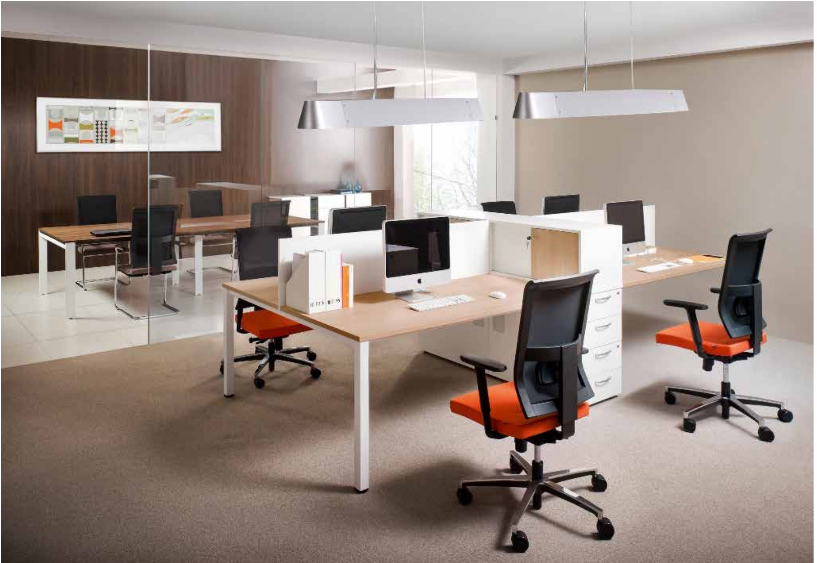
Image: Mikomax Smart Office