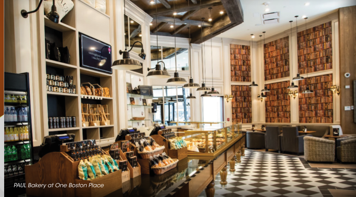
PAUL Bakery at One Boston Place

Recent retail transactions have been a huge boost of strength to this neighborhood. Wildly successful openings include grocer Roche Bros. , apparel giants Primark and Forever 21 (coming soon), and new dining selections such as Pret A Manger, PAUL Bakery, Caffé Nero, LX by Legal Seafoods and Clover among several others.