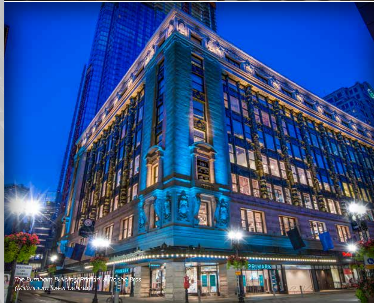
The Burnham Building, Primark & Roche Bros. (Millennium Tower behind)