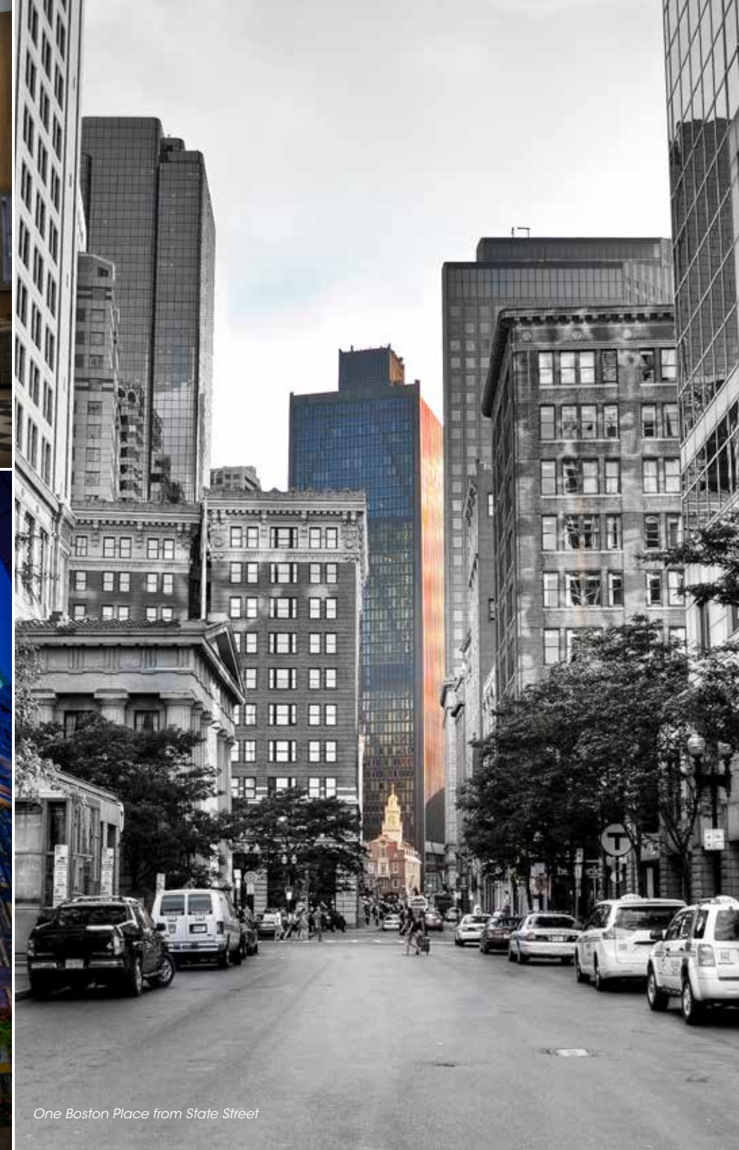
One Boston Place from State Street