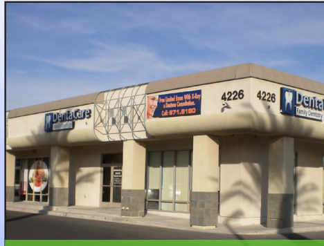
Durango Plaza 4226 & 4266 South Durango Drive Las Vegas, NV Retail