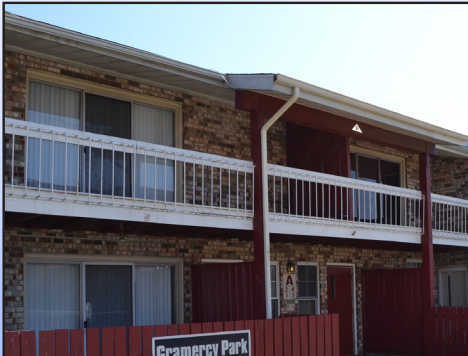
Gramercy Park Apartments 2880 Hull Road Camden, NJ 08104 Multifamily