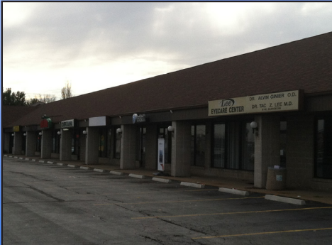
Oakmont Plaza 16761 St. Clair Avenue Culcutta, OH Retail