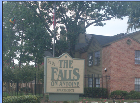
Falls on Antoine 6101 Antoine Drive Houston, TX Multifamily