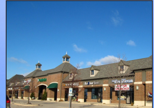
Concord Town Center W3192 County Road KK Appleton, WI Retail