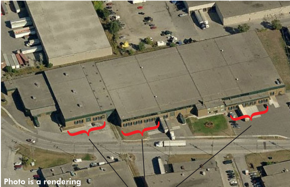
Photo is a rendering

Additional shipping can be made available