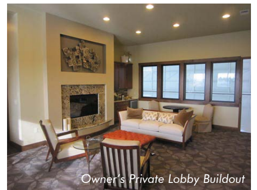
Owner's Private Lobby Buildout