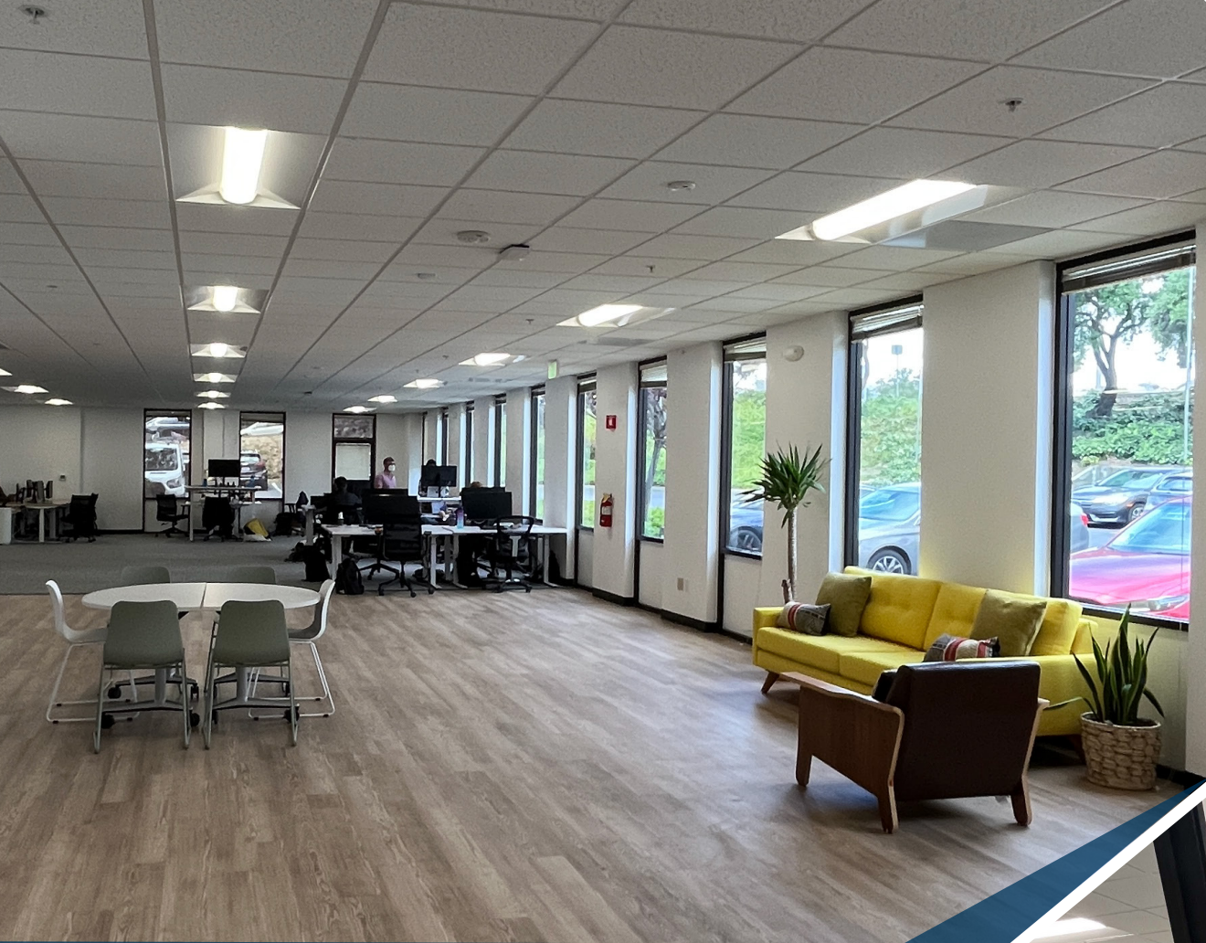
OPEN OFFICE AREA