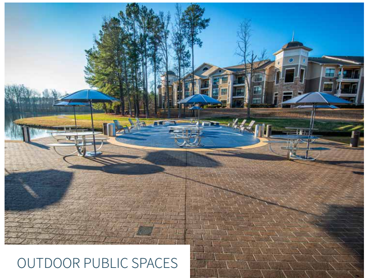
OUTDOOR PUBLIC SPACES