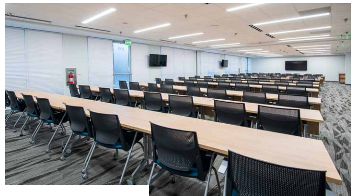
TENANT LOUNGE AND SHARED CONFERRING