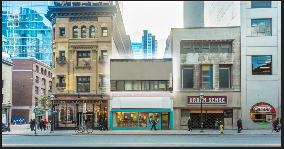
144 YONGE STREET