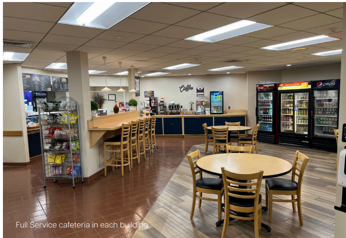
Full Service cafeteria in each building