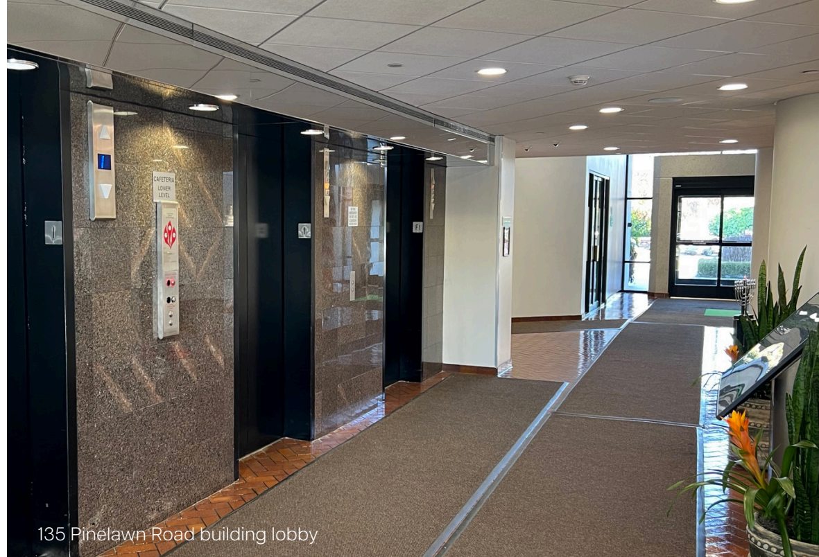
135 Pinelawn Road building lobby