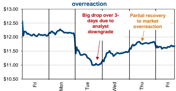
Cameco - a recent example of short term market