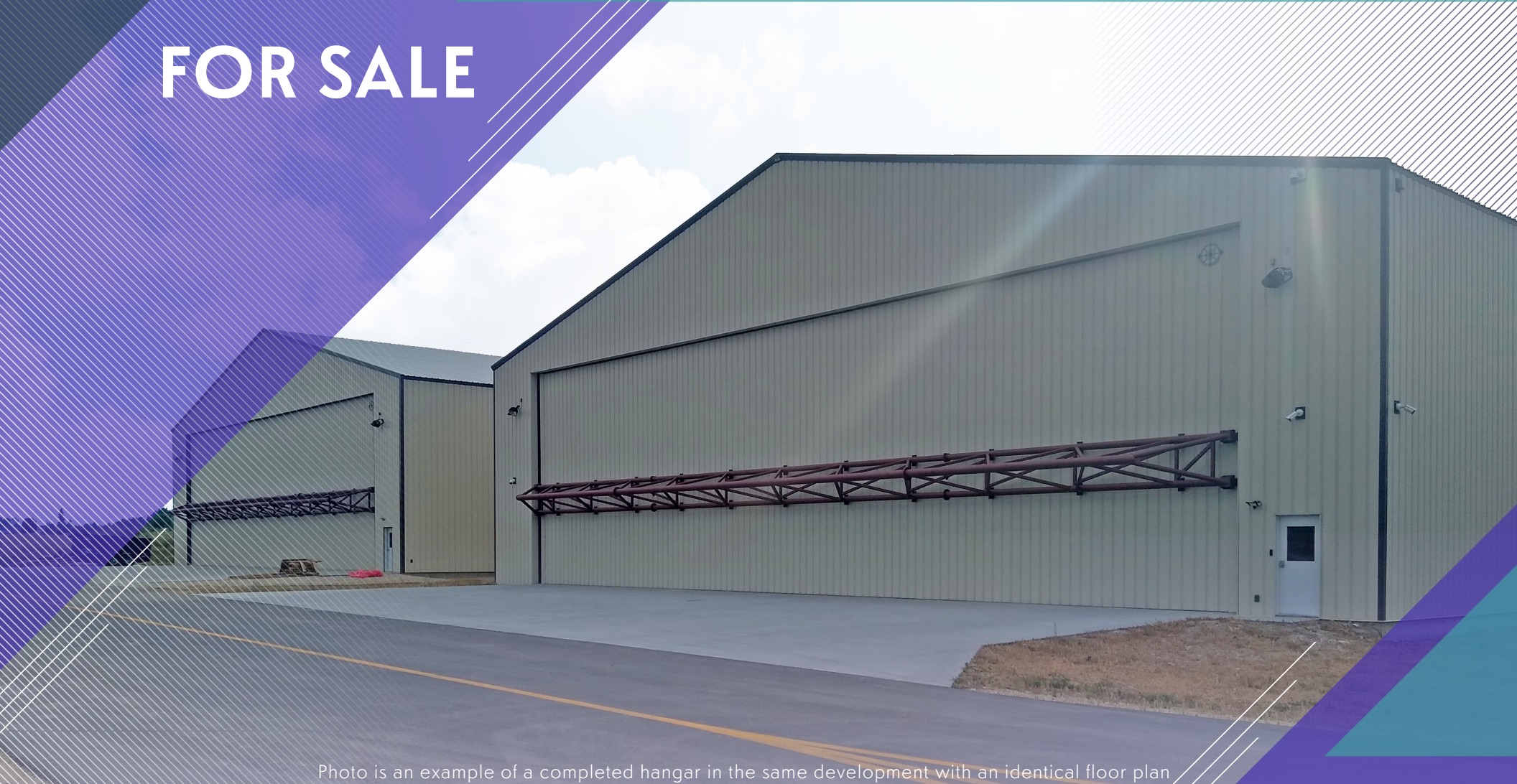
Photo is an example of a completed hangar in the same development with an identical floor plan

±12,000 SF AIRCRAFT HANGAR FACILITY FOR SALE AT BILLINGS-LOGAN INTERNATIONAL AIRPORT