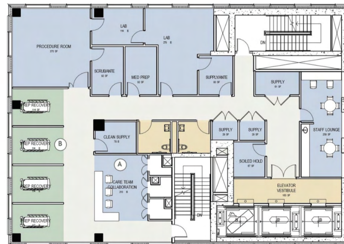
FERTILITY CLINIC 2