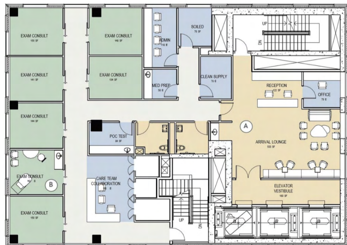
FERTILITY CLINIC 1