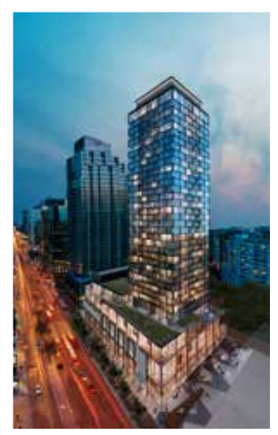
5200 YONGE STREET