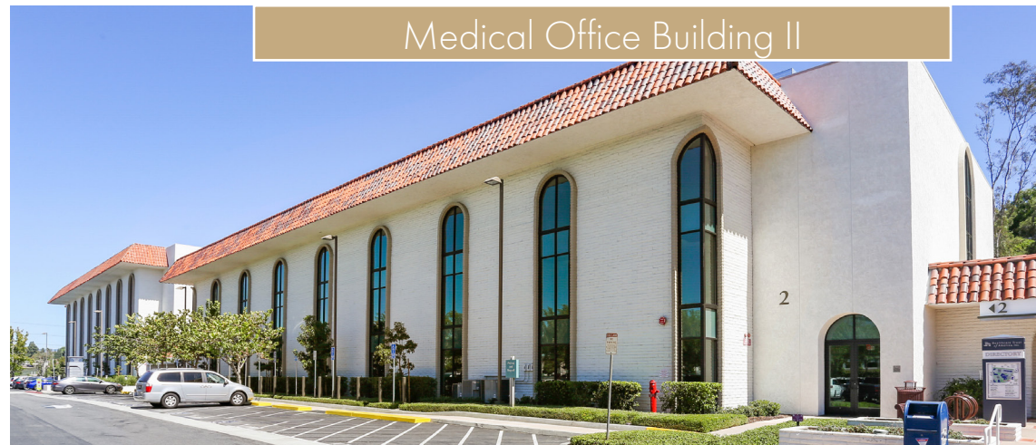
Medical Office Building II