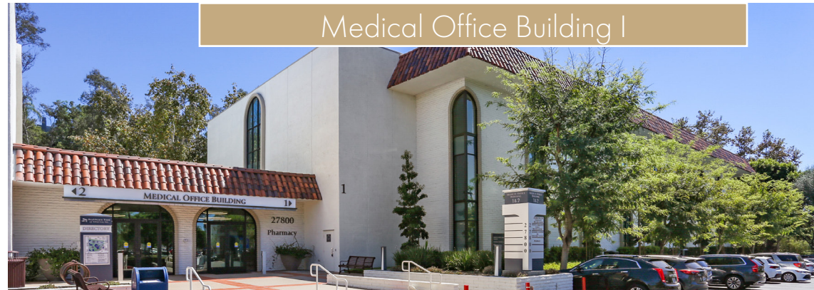
Medical Office Building I