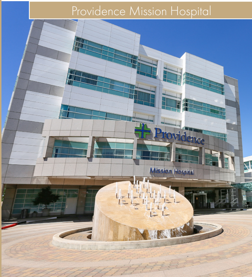
Providence Mission Hospital