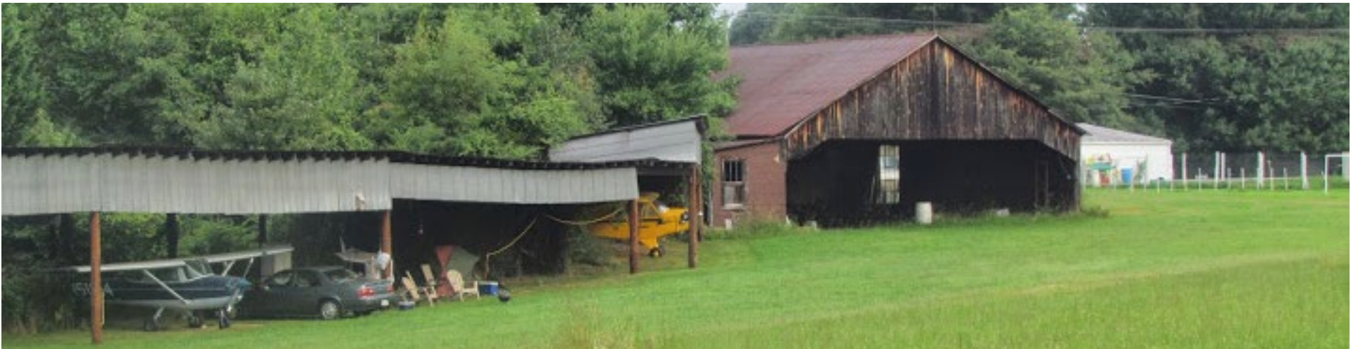
Large hanger barn