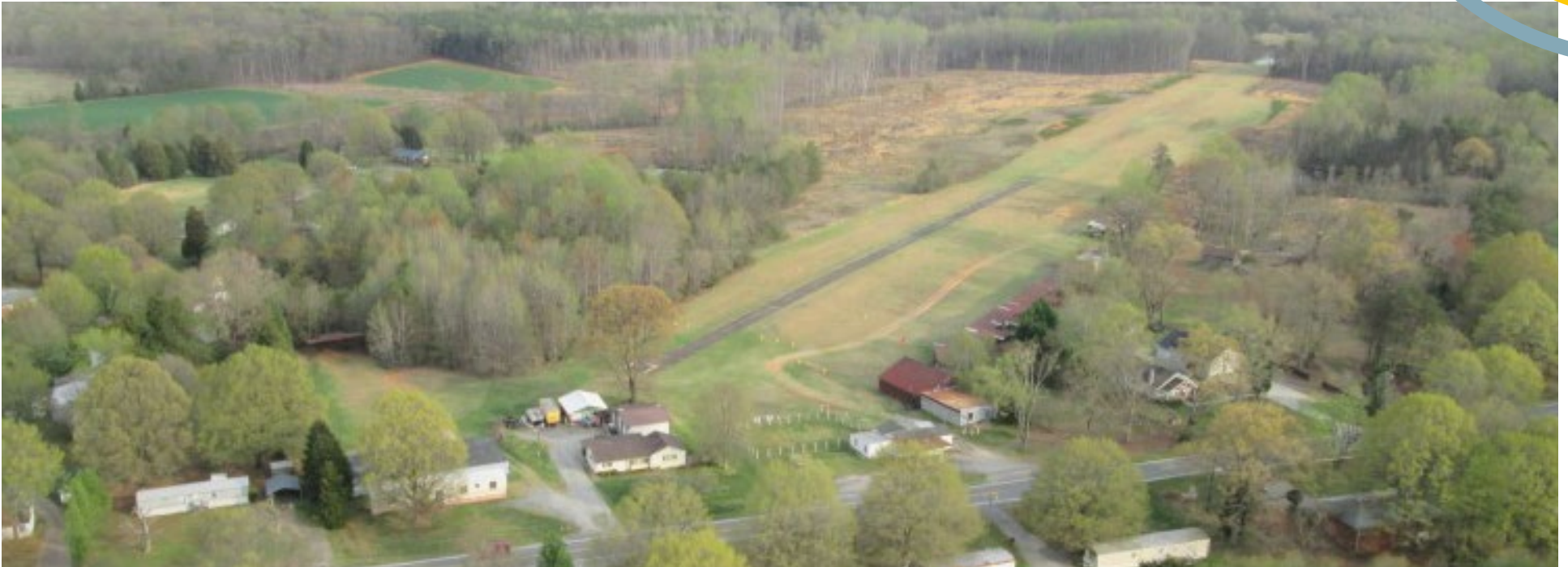
Aerial view of runway