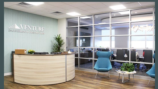
Clockwise from top left: new lobby & atrium, second floor open office – ready for customization, sample reception area, conference room & kitchen