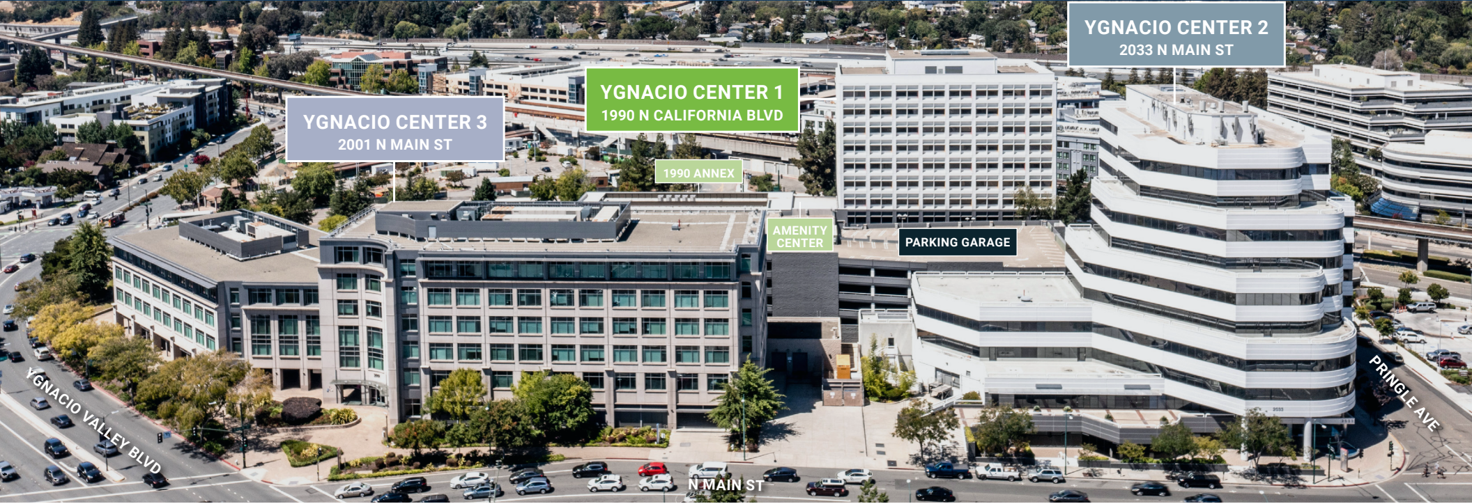
YGNACIO CENTER 2 2033 N MAIN ST